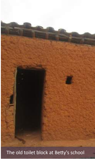
The old toilet block at Betty's school

We have chosen to partner with Health Poverty Action because of our similar values, and the complementary nature of our work. Their work to tackle the root causes of poverty and poor health fits well with our own mission to help communities improve their farming techniques and develop profitable livelihoods.